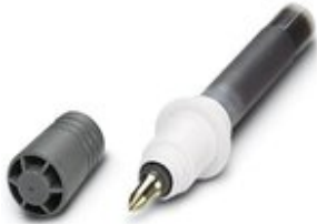
Marker pen, color: black

Please be informed that the data shown in this PDF Document is generated from our Online Catalog. Please find the complete data in the user's documentation. Our General Terms of Use for Downloads are valid ( http://phoenixcontact.com/download )